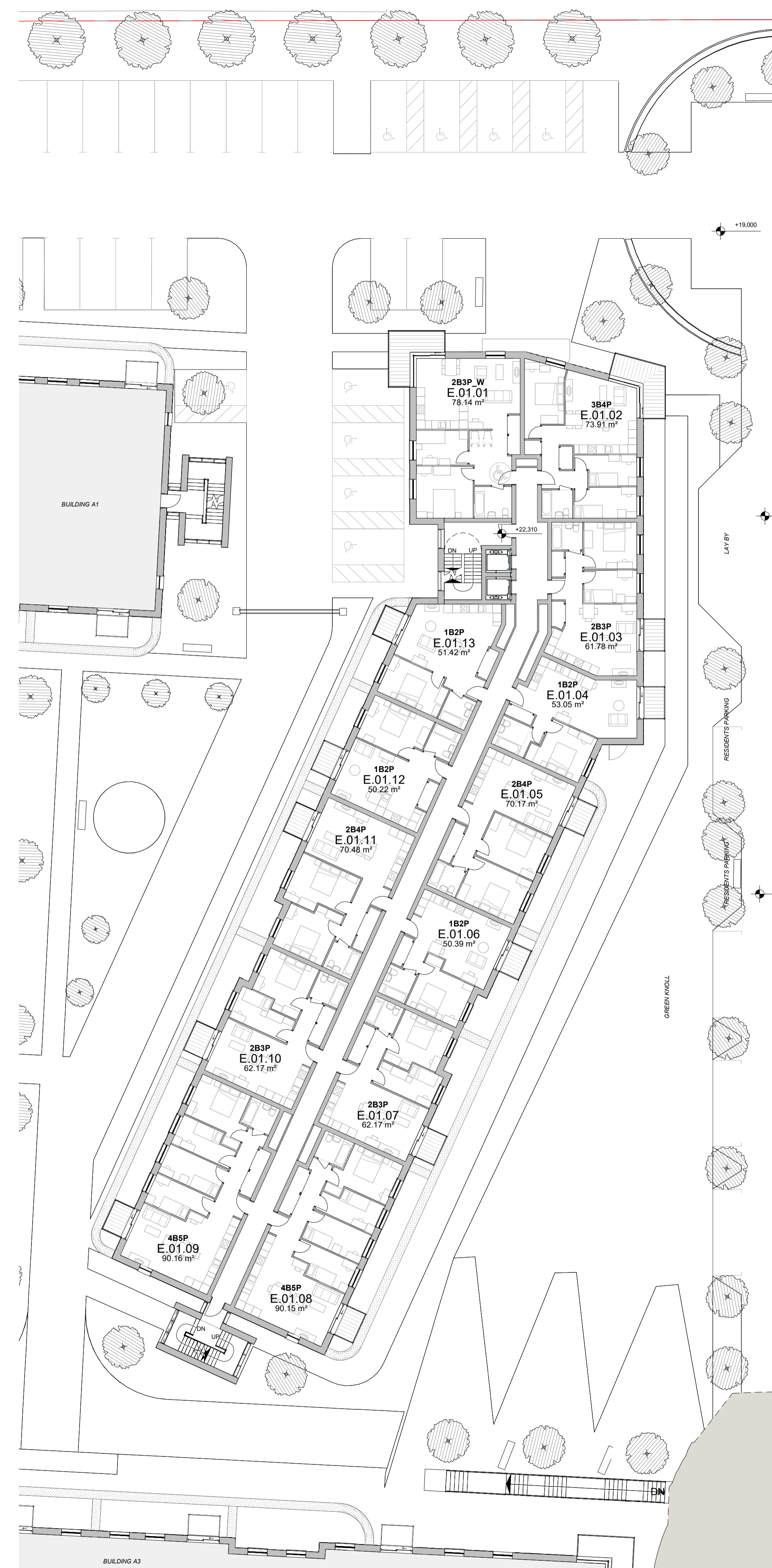
2 Level 1 +22.300 AOD 1:200